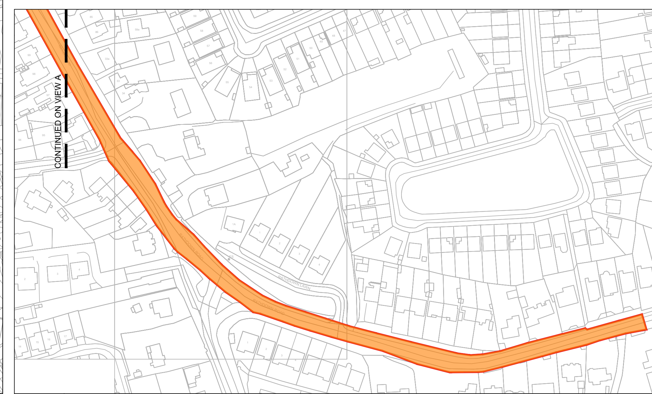
B PROPOSED PHASING PLAN - CONTINUED 0606 Scale: 1:1500